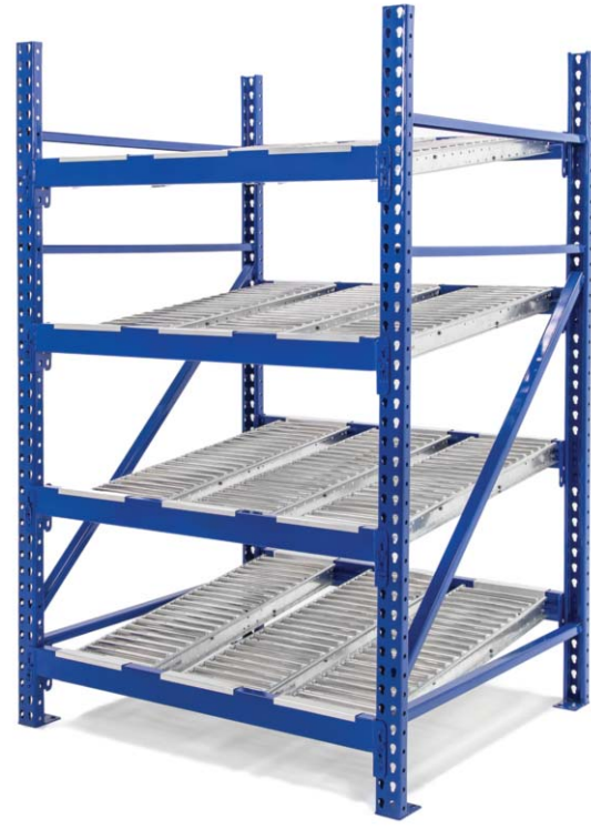
Low Profile Unit

Shown with four levels of SpanTrack Lane (0.75" aluminum roller)